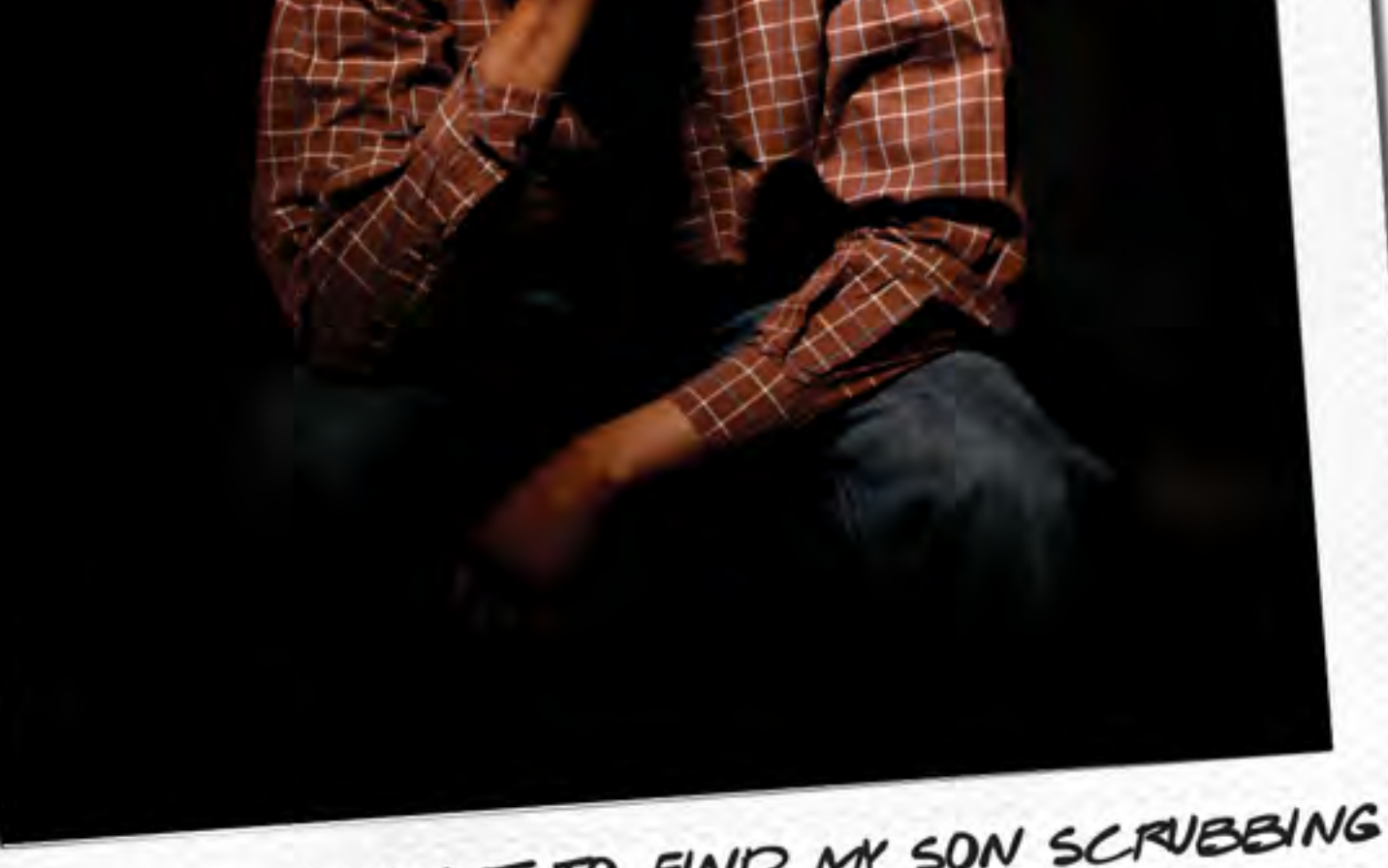
"IT BROKE MY HEART TO FIND MY SON SCRUBBING HIMSELF WITH BLEACH TO MAKE HIMSELF WHITER IT TURNS OUT HE WAS EXPERIENCING RACISM AT SCHOOL I DON'T KNOW HOW TO HELP HIM"